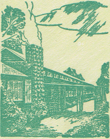
VOLCANO HOUSE HAWAII NATIONAL PARK HAWAII