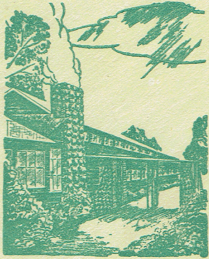
VOLCANO HOUSE HAWAII NATIONAL PARK HAWAII